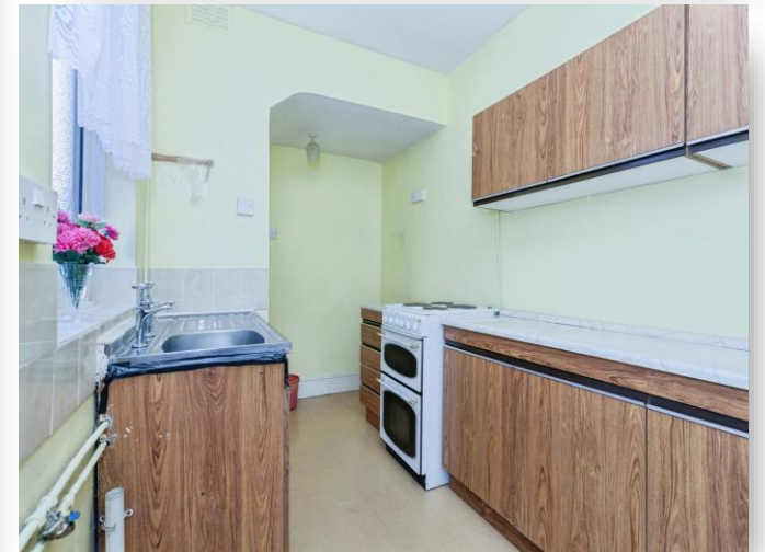
Vaughan Street, Leicester LE3 5JN