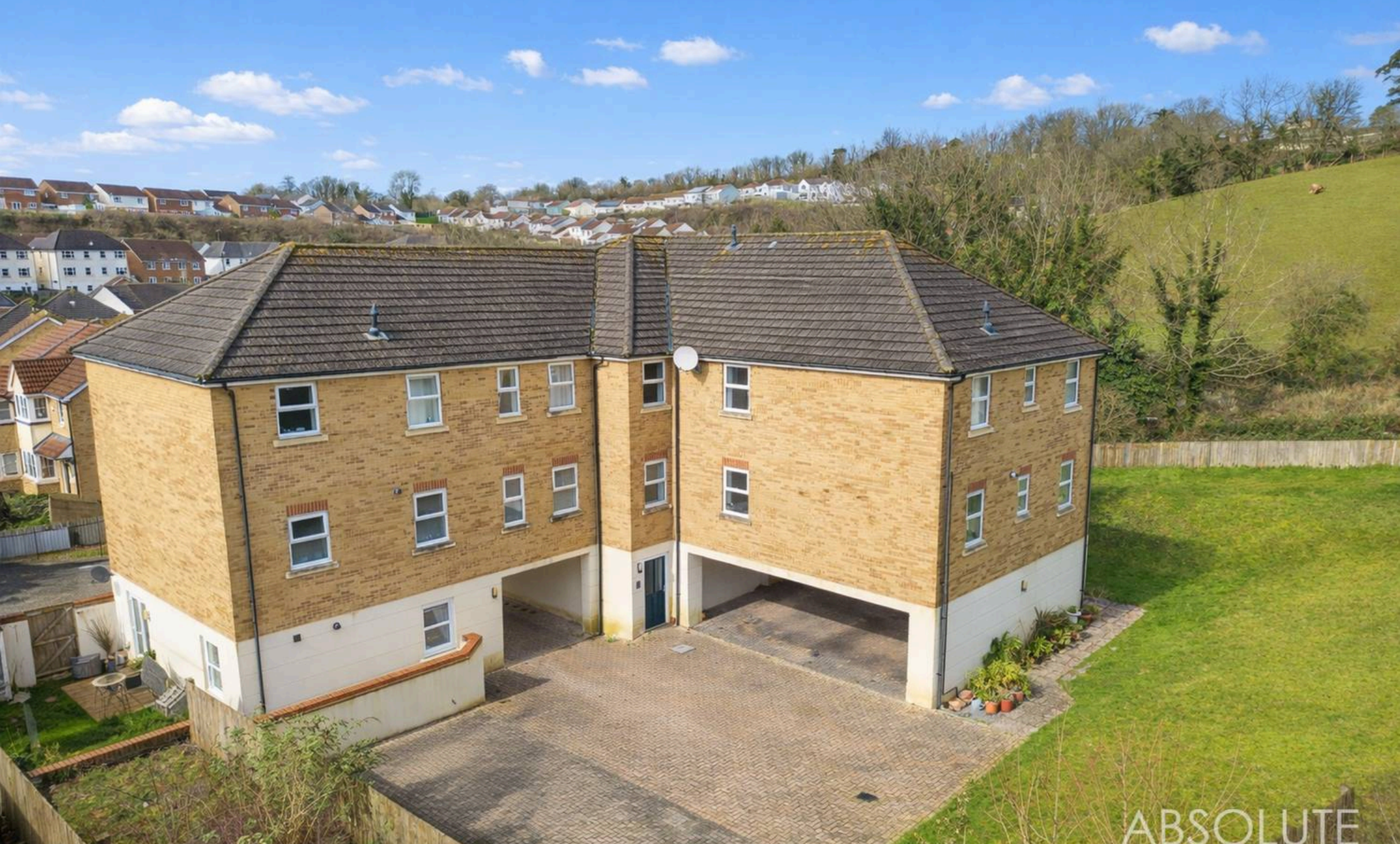
Darwin Court, Darwin Crescent, Torquay – TQ2 7FN £165,000