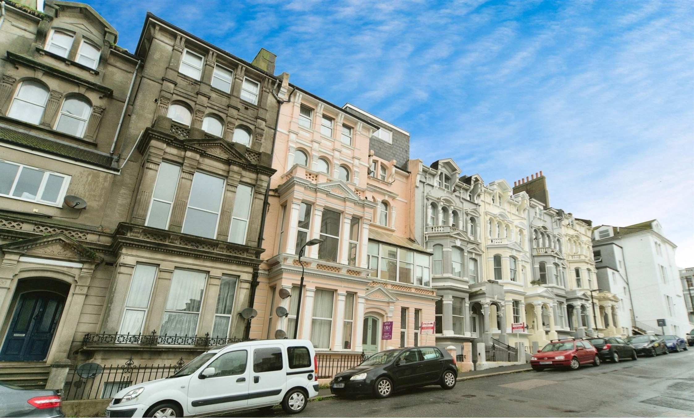
Invergordon House - Warrior Gardens, St. Leonards-On-Sea TN37 6EB