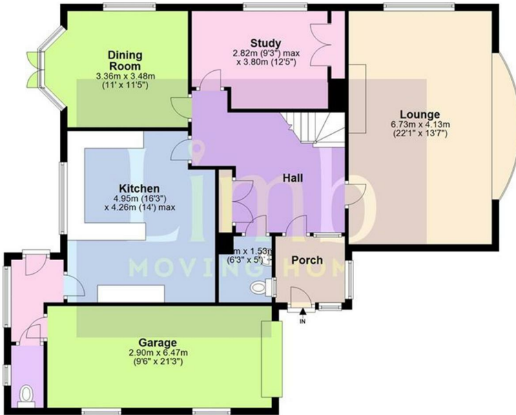
Ground Floor Approx. 121.2 sq. metres (1304.9 sq. feet)