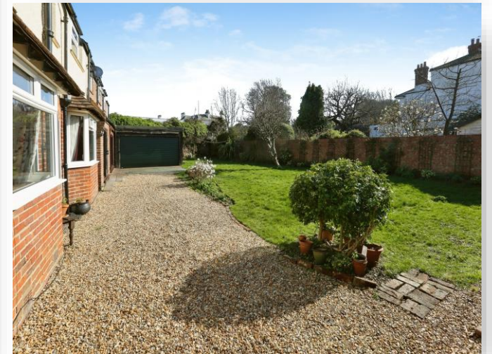
St Peter's, Ellachie Mews, Gosport, PO12 2DR