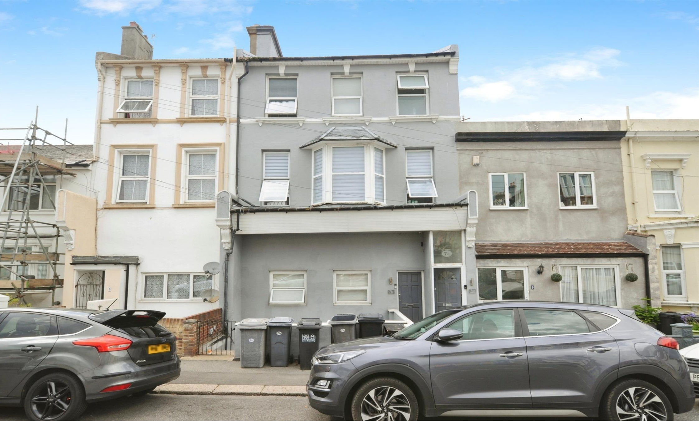
St. Georges Road, Hastings TN34 3NH