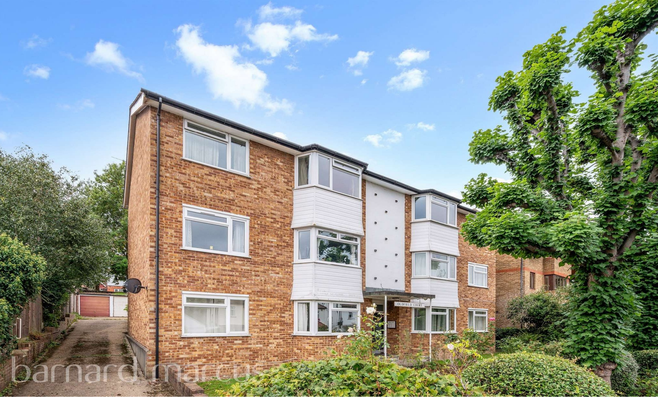
Oldfield Court, Cranes Park Crescent, Surbiton, KT5 8AW