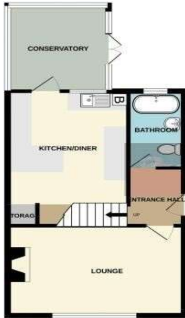
GROUND FLOOR 471 sq. ft. (43.8 sq.m.) approx.