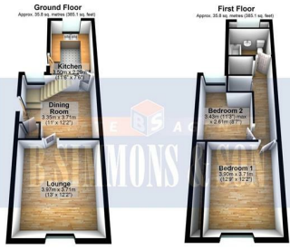
Total area: approx. 71.6 sq. metres (770.2 sq. feet)

Whilst every attempt has been made to ensure the accuracy of the floor plan contained here, measurements of doors, windows and rooms are approximate and no responsibility is taken for any error, omission or misstatement. These plans are for representation purposes only and should be used as such by any prospective purchaser. Specifically no guarantee is given on the total square footage of the property if quoted on this plan. Any figure given is for initial guidance only and should not be relied on as a basis of a valuation or for any legal purpose. Plan produced using PlanUp.