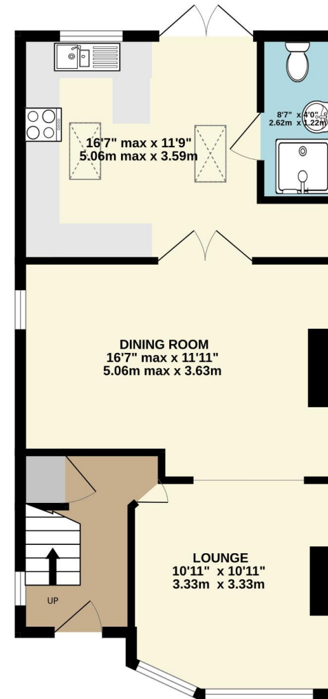
GROUND FLOOR 541 sq.ft. (50.3 sq.m.) approx.