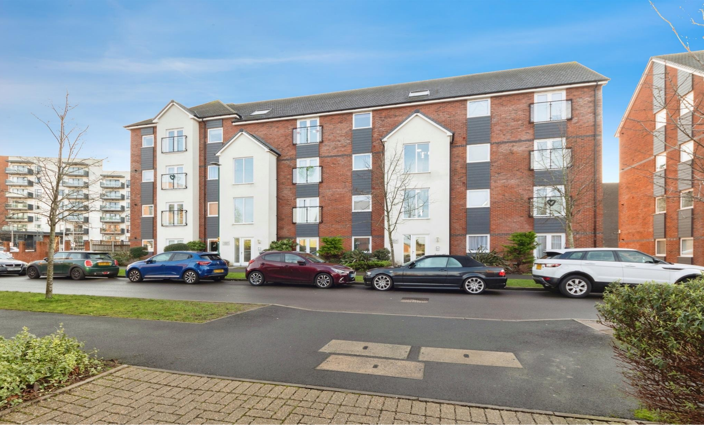
Victoria Crescent, Shirley SOLIHULL B90 2FG