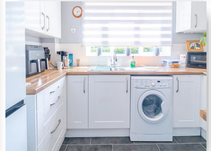
Barbury Court, Giffard Park, MILTON KEYNES, MK14 5PT