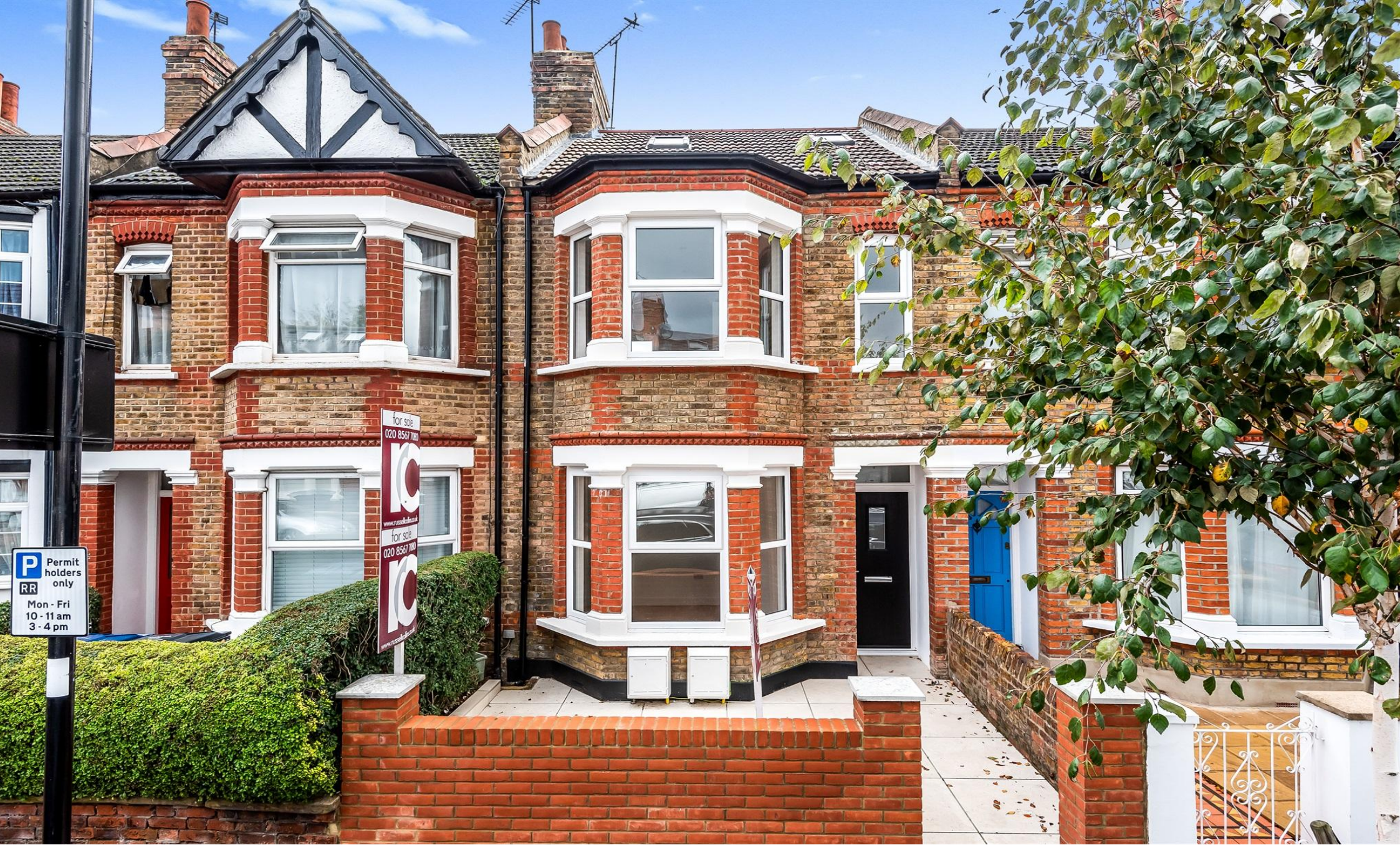
Darwin Road, London, W5 4BD