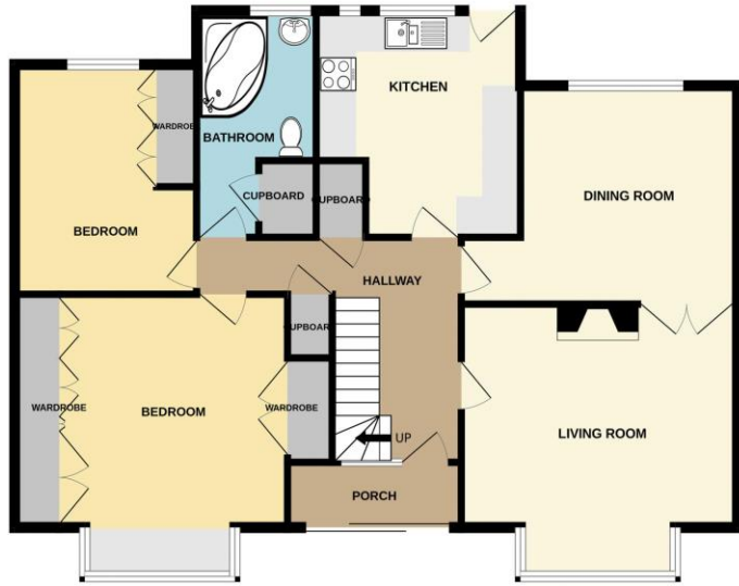
GROUND FLOOR 1035 sq.ft. (96.2 sq.m.) approx.