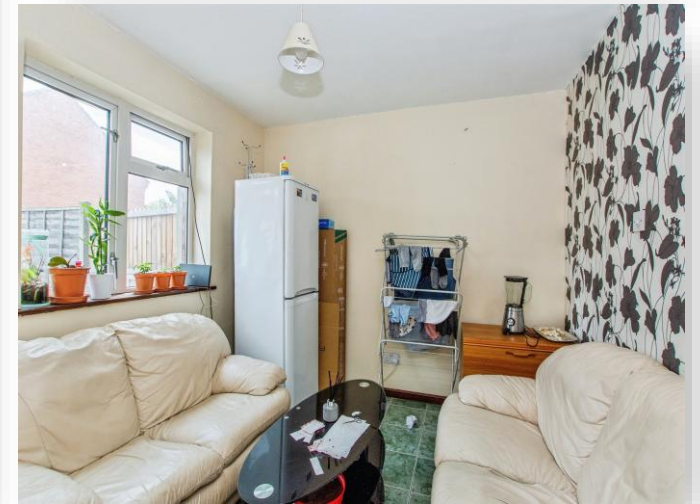
Grosvenor Road, Wisbech PE13 3NB