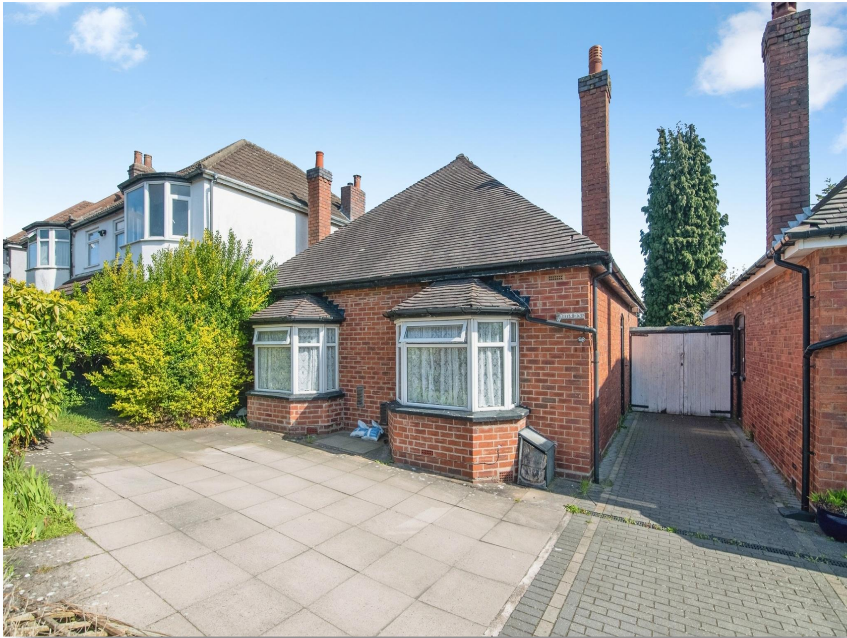
Walsall Road, Great Barr Birmingham B42 1EH