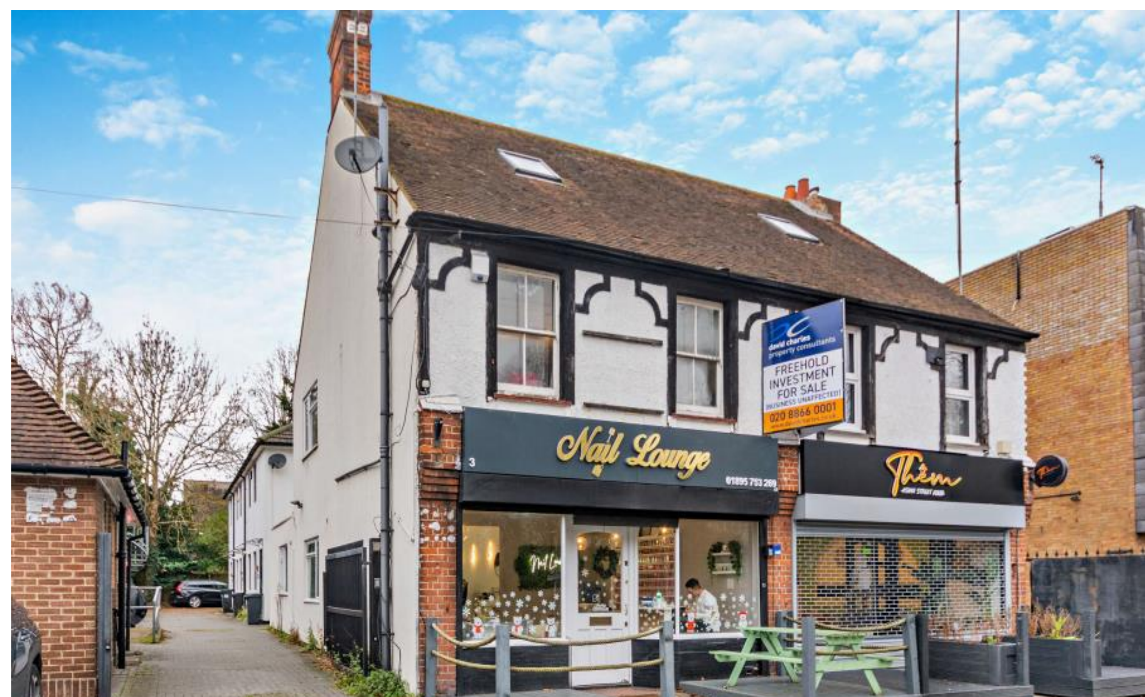
A second floor studio flat in a convenient location for local amenities High Road, Ickenham, UB10 8LE