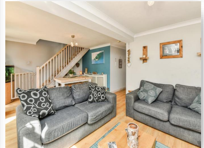
Nightingale Avenue, Frome, BA11 2UW