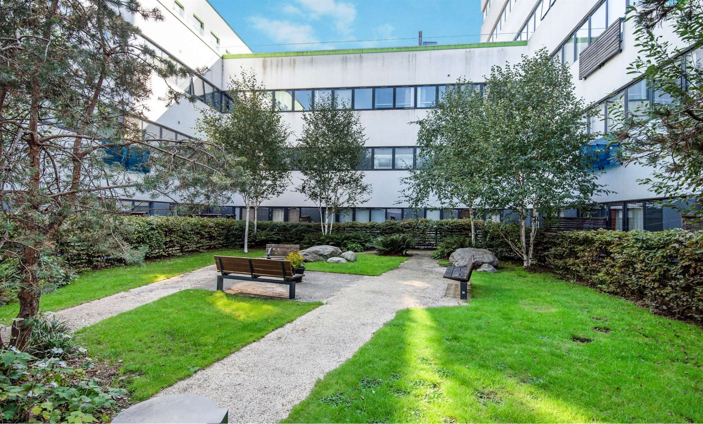
Six Hills House, Kings Road, Stevenage, SG1 1AW