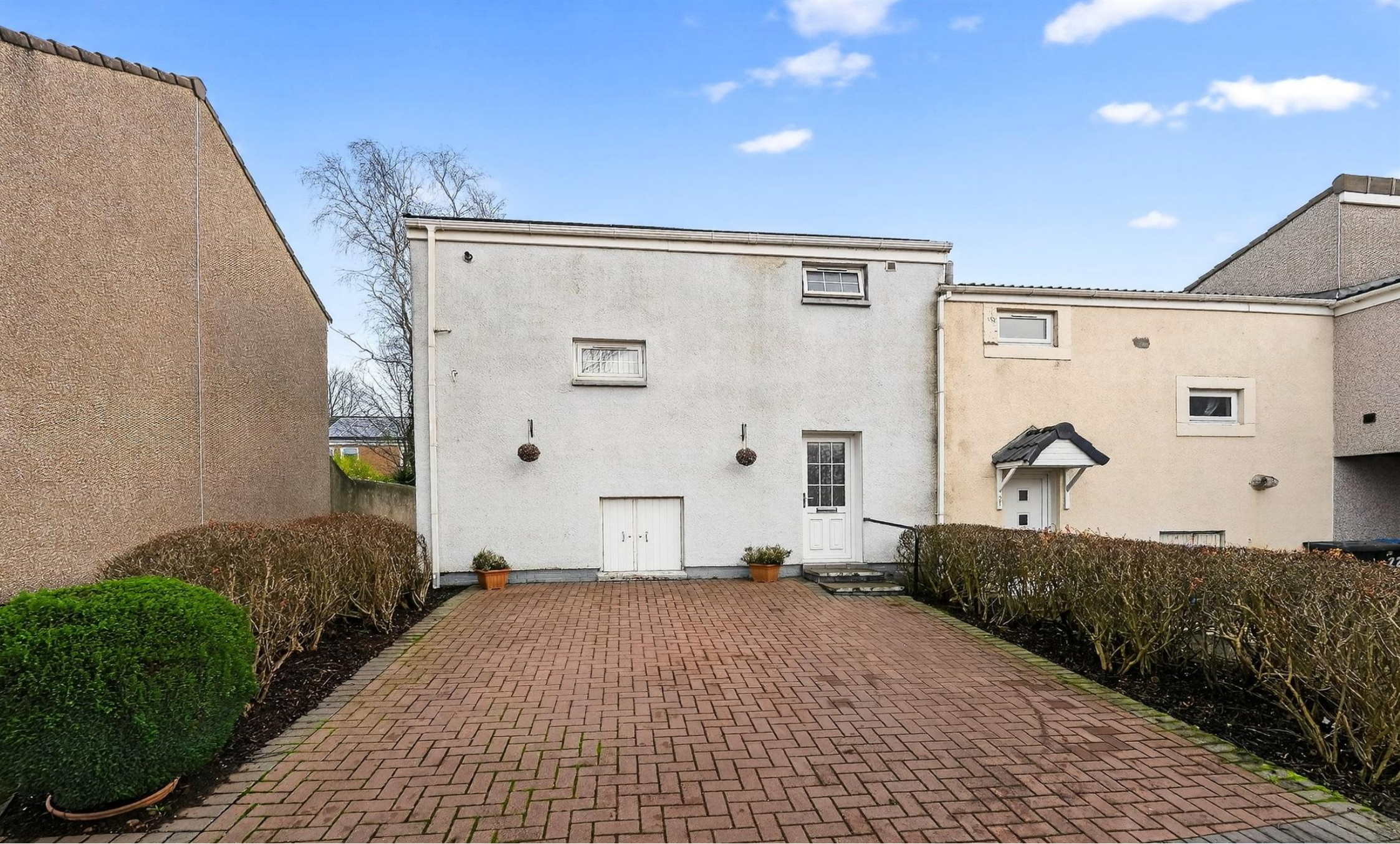
Barra Crescent, Broomlands Irvine KA11 1DE