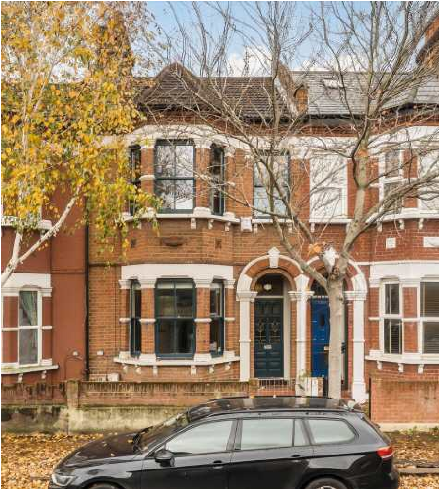
Millfields Road, E5 £1,000,000