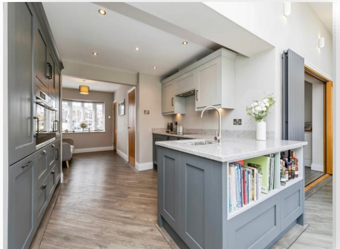
Allington Drive, Billingham TS23 3UA