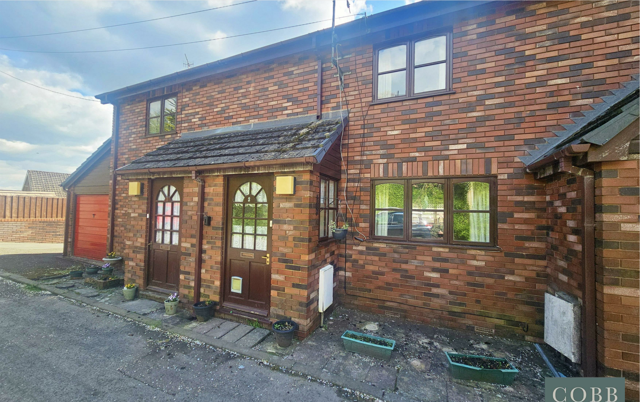
2, Cwm View Cottages, Knighton, LD7 1HF Offers In The Region Of £125,000