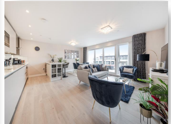
Penthouse, Waterside Court, The Colonnade, Maidenhead SL6 1DL