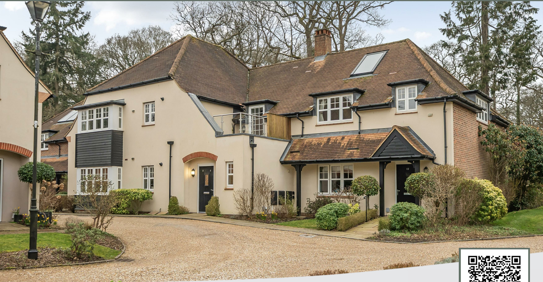
9 Frenchlands Gate East Horsley, Surrey KT24 6BF