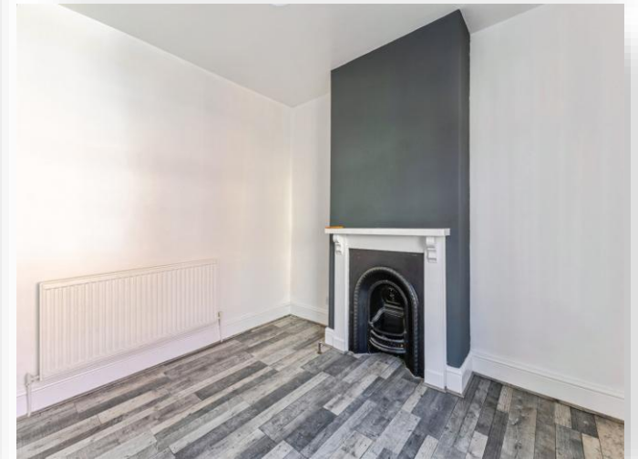
Baker Street, Northampton NN2 6DH