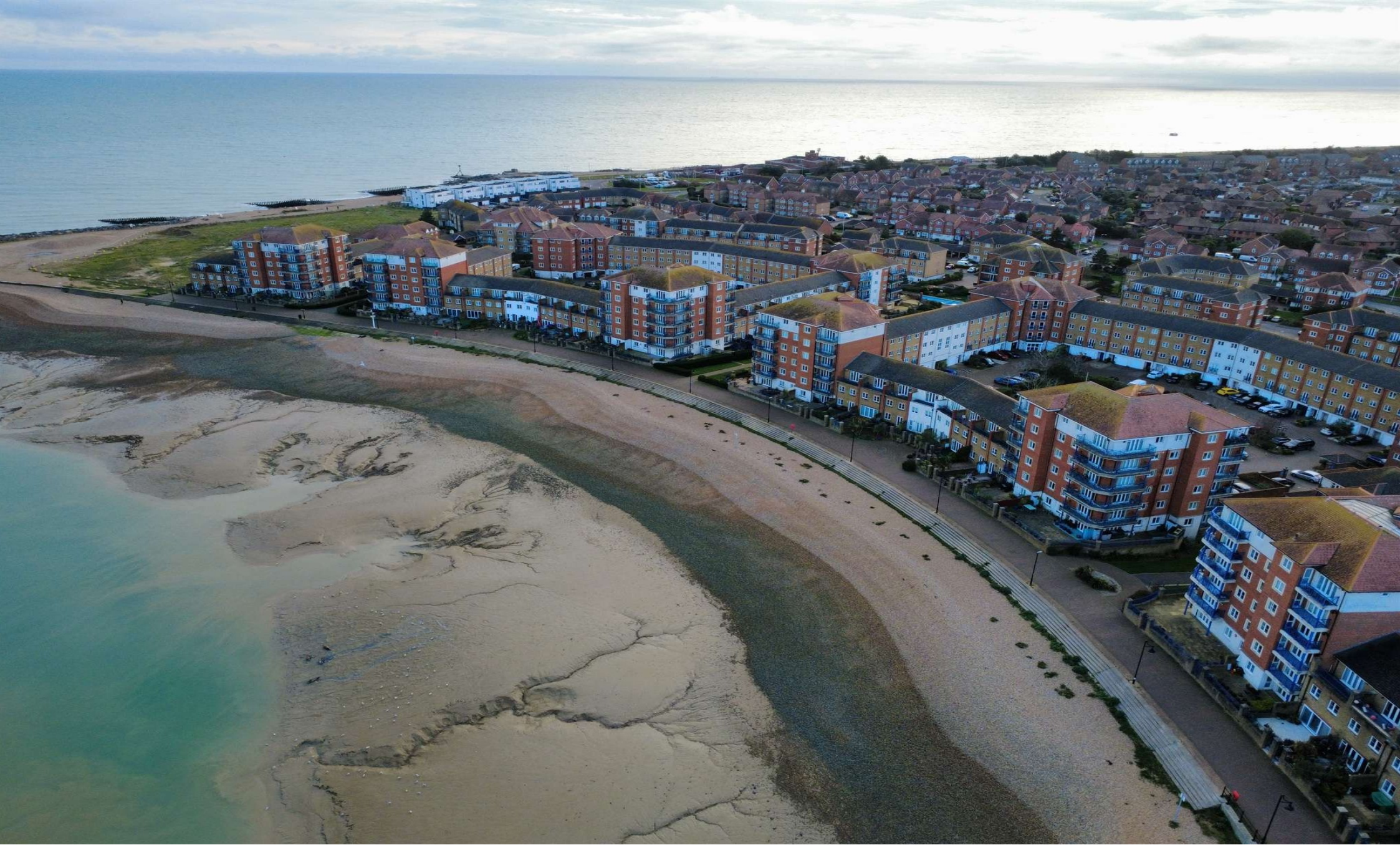
Dominica Court, Eastbourne BN23 5TR