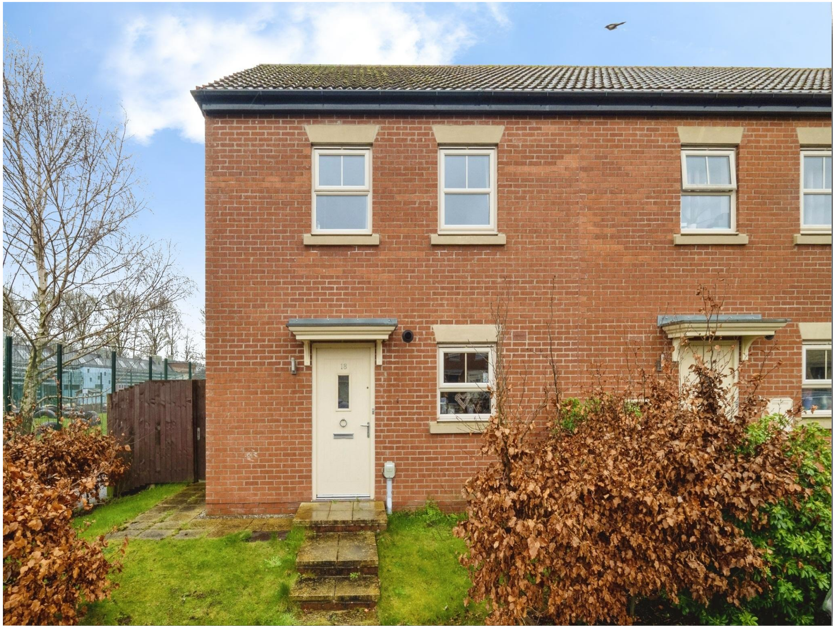
Frances Brady Way, Hull, HU9 3BW