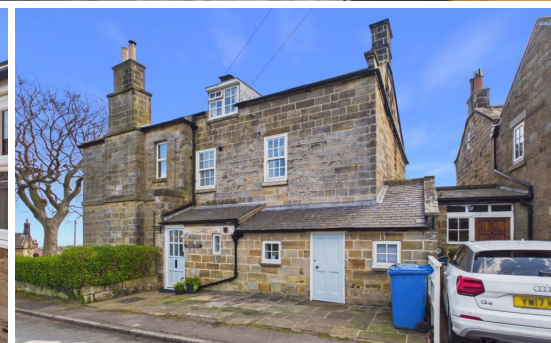
2 THORPE GREEN, FYLINGTHORPE- 3 bed Cottage -£350,000