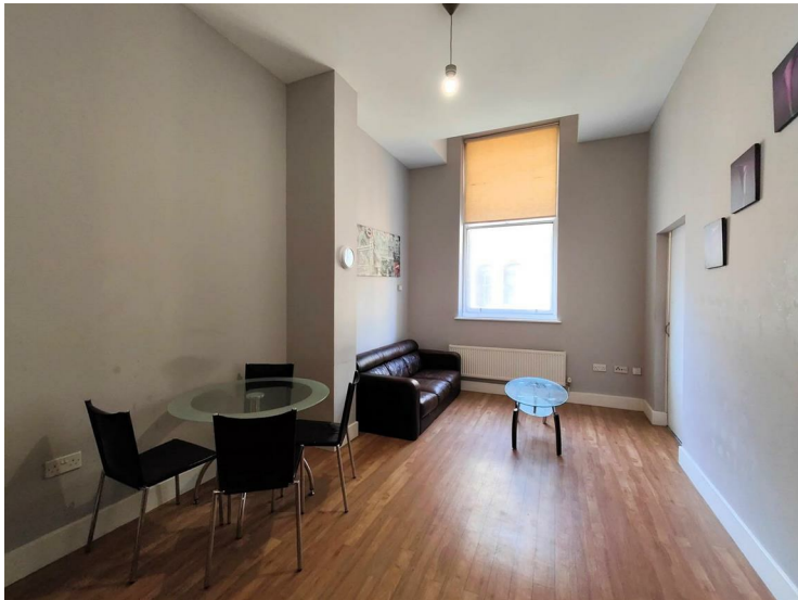
LOUNGE 27'9" x 12'3" (8.46 x 3.73)