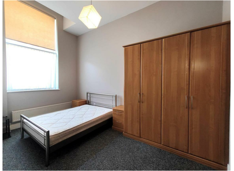
BEDROOM ONE 8'6" x 15'9" (2.59 x 4.80)