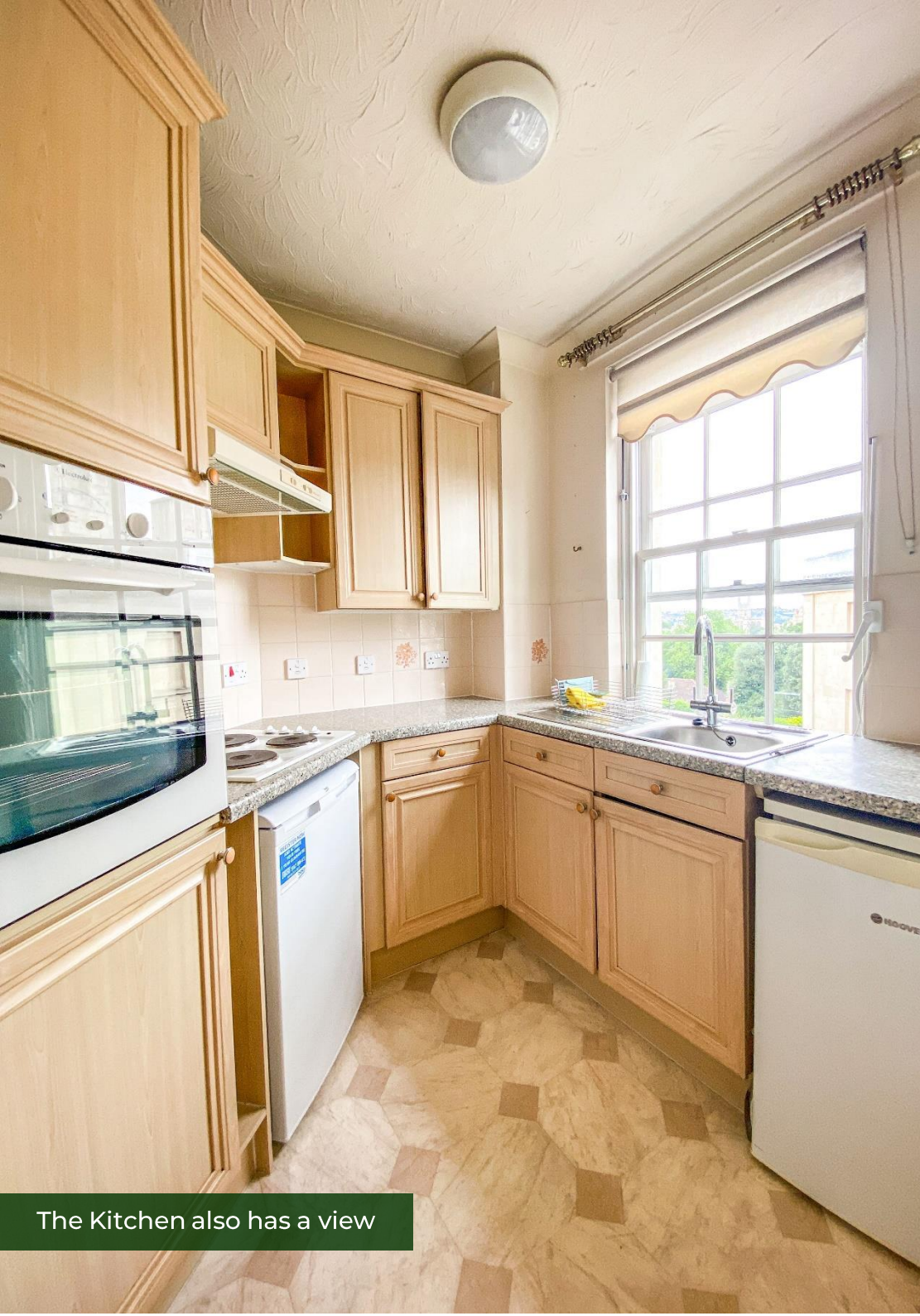
The Kitchen also has a view