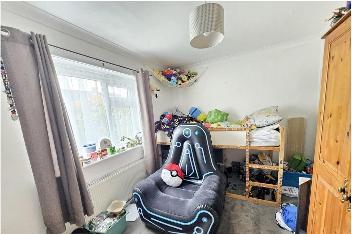
Martin & Co Are Proud To Present This Charming 3 Bedroom Detached Bungalow with Expansive Rear Garden