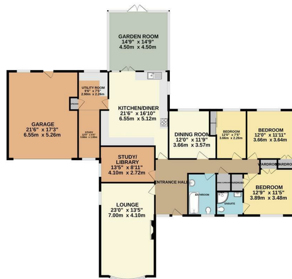
TOTAL FLOOR AREA: 2304 sq.ft. (214.1 sq.m.) approx. While every effort has been made to ensure the accuracy of the figures contained herein, measurements of areas, volumes, levels and any other data are approximate and not guaranteed. The plan is for illustrative purposes only and should be used in conjunction with the particulars. The accuracy, validity and appropriateness of the data are not guaranteed. The plan is for illustrative purposes only and should be used in conjunction with the particulars. The accuracy, validity and appropriateness of the data are not guaranteed. The plan is for illustrative purposes only and should be used in conjunction with the particulars. The accuracy, validity and appropriateness of the data are not guaranteed.