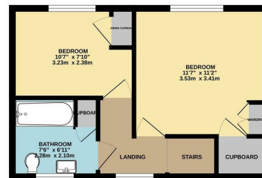
TOTAL FLOOR AREA: 640 sq.ft. (59.4 sq.m.) approx.

While every attempt has been made to ensure the accuracy of the floorplan contained here, measurements of doors, windows, rooms and any other items are approximate and no responsibility is taken for any error, omission or mis-statement. This plan is for illustrative purposes only and should be used as such by any prospective purchaser. The services, systems and appliances shown have not been tested and no guarantee as to their operability or efficiency can be given. Made with floorplan 12025