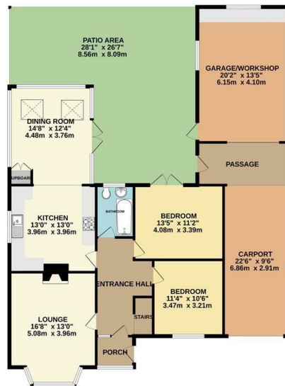
1ST FLOOR 785 sq.ft. (72.9 sq.m.) approx.