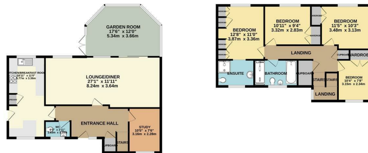
1ST FLOOR 721 sq.ft. (67.0 sq.m.) approx.