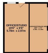
TOTAL FLOOR AREA: 1951 sq.ft. (181.3 sq.m.) approx.

While every attempt has been made to ensure the accuracy of the floorplan contained here, measurements of doors, windows, rooms and any other items are approximate and no responsibility is taken for any error, omission or mis-statement. This plan is for illustrative purposes only and should be used as such by any prospective purchaser. The services, systems and appliances shown have not been tested and no guarantee as to their operability or efficiency can be given. Made with Metropex C004