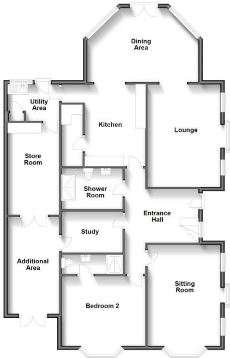
Ground Floor Approx. 148.9 sq. metres (1603.0 sq. feet)