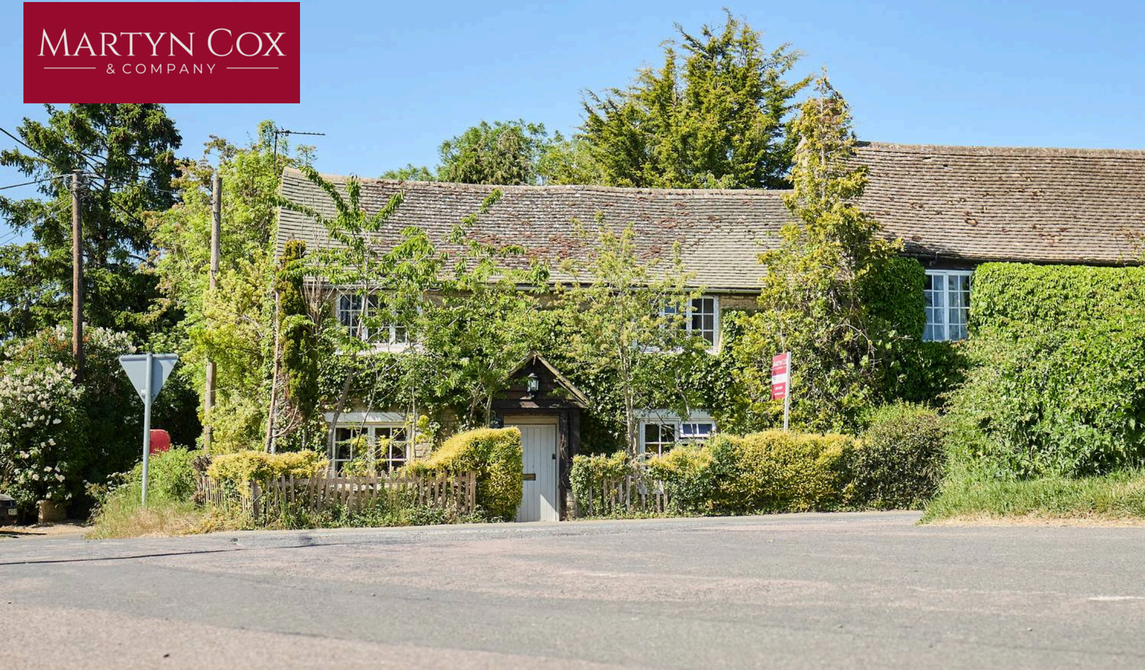
Moss Rose Cottage, Cote Bampton