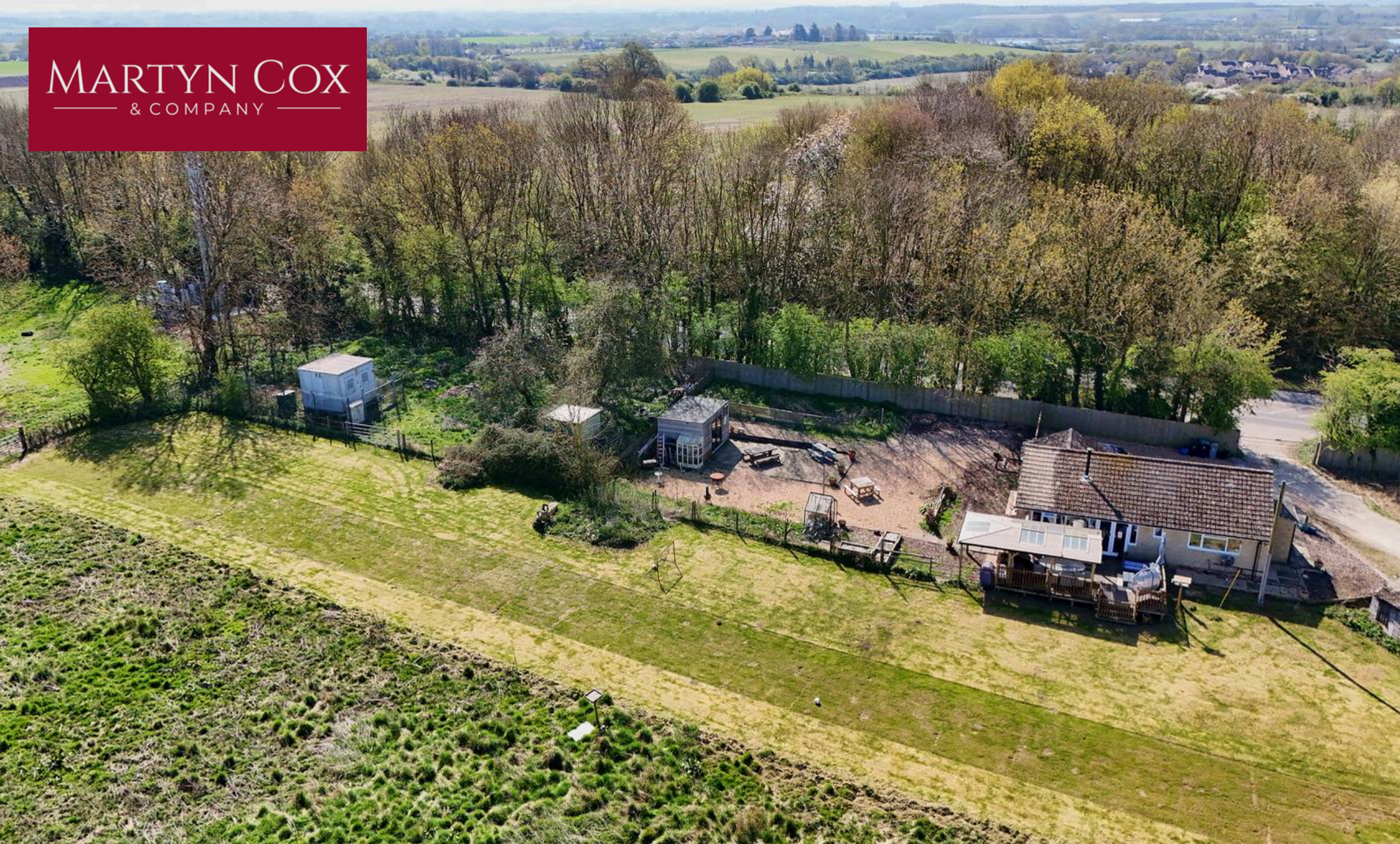
Gibbetts Close Farm Oxford Hill, Witney – OX29 6UT Witney