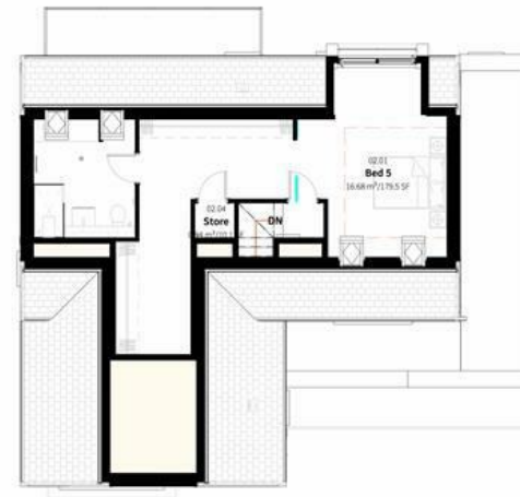
3 GA_Plan_02-Second 1:100

Four Architects Limited (11613893) Notes: This drawing is copyright. Do not scale dimensions from drawings. All dimensions must be checked on site by contractor or suitable qualified individuals. Contractor to report any discrepancies, errors or omissions prior to commencing work.