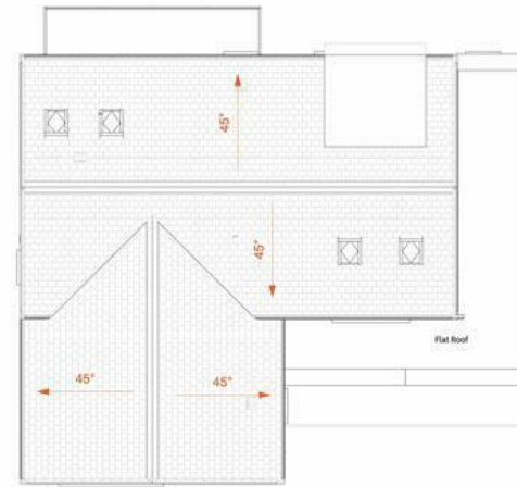
4 GA_Plan_Roof 1:100