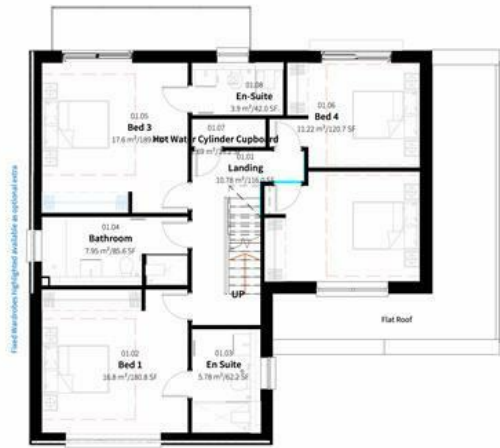
2 GA_Plan_01-First 1:100