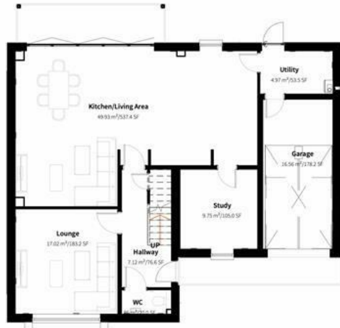
1 GA_Plan_00-Ground 1:100

Four Architects Limited (11613893) Notes: This drawing is copyright. Do not scale dimensions from drawings. All dimensions must be checked on site by contractor or suitable qualified individual. Contractor to report any discrepancies, errors or omissions prior to commencing work.