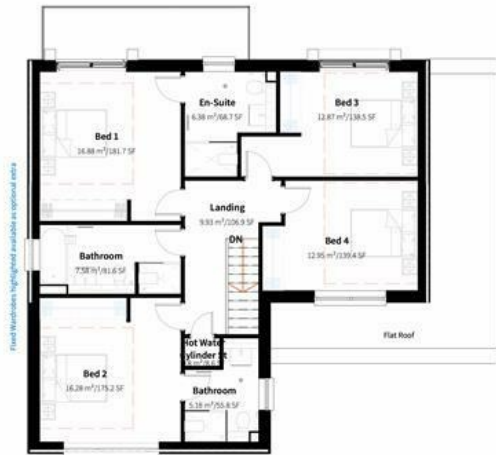
2 GA_Plan_01-First 1:100