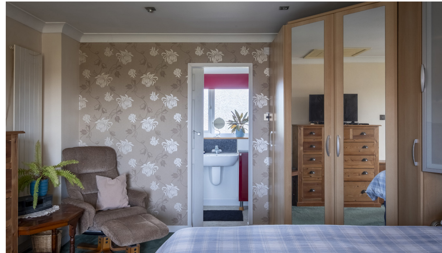
Bedroom detail with walk-in wardrobe and ensuite entrance