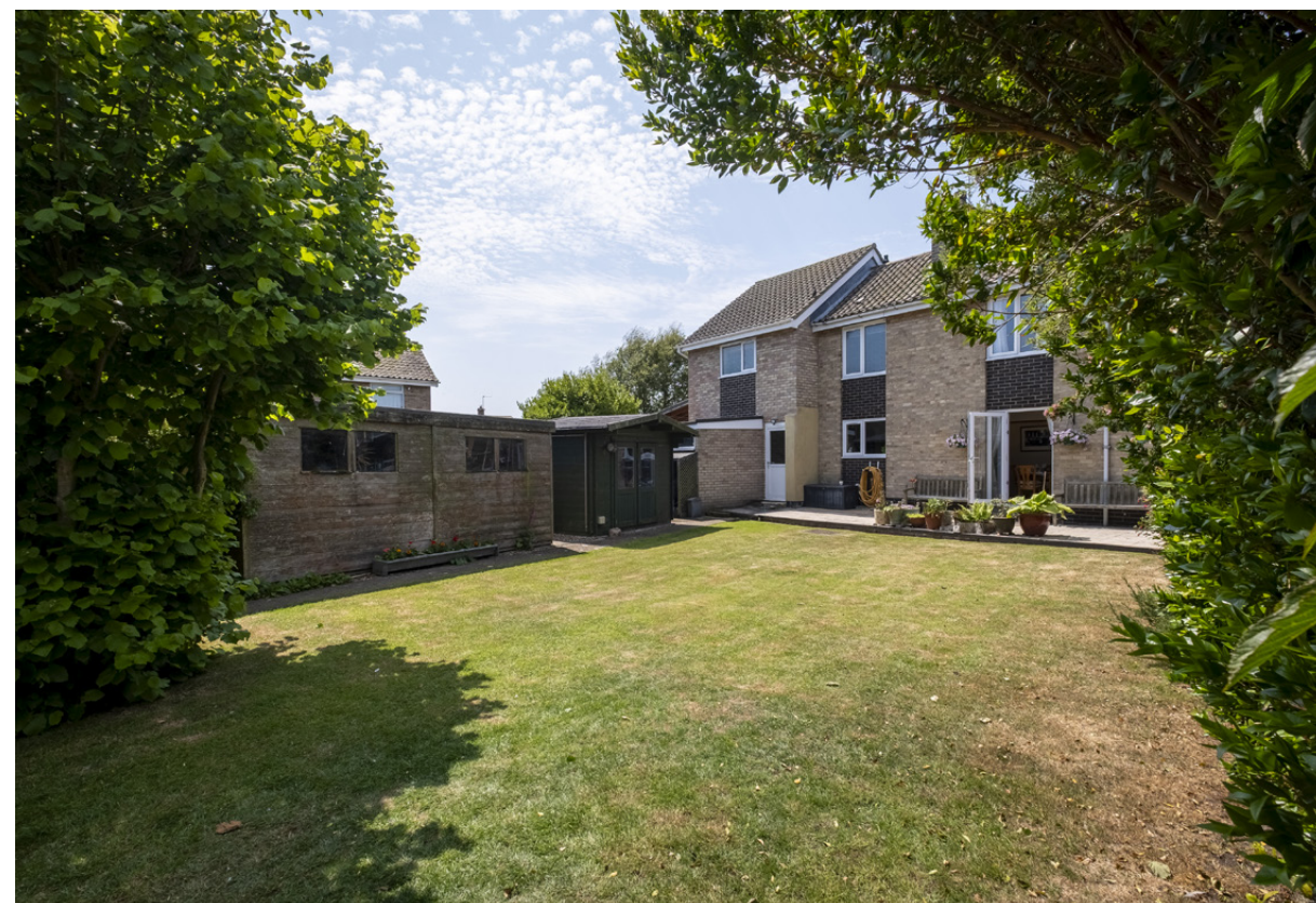
Lawned garden area with garden office/studio and storage shed