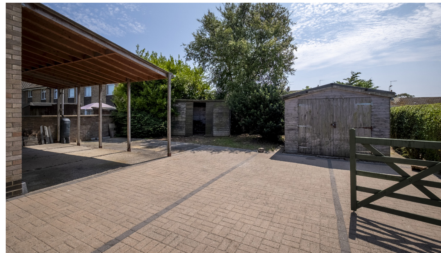
Driveway, car port, and firewood storage sheds