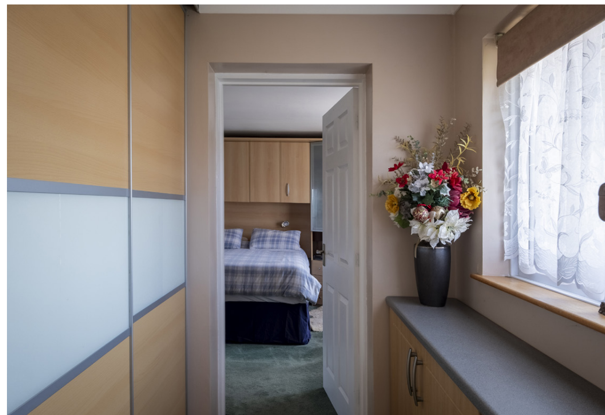
Approach to primary bedroom with fitted storage