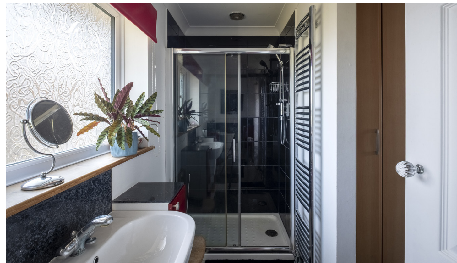
Ensuite to primary bedroom