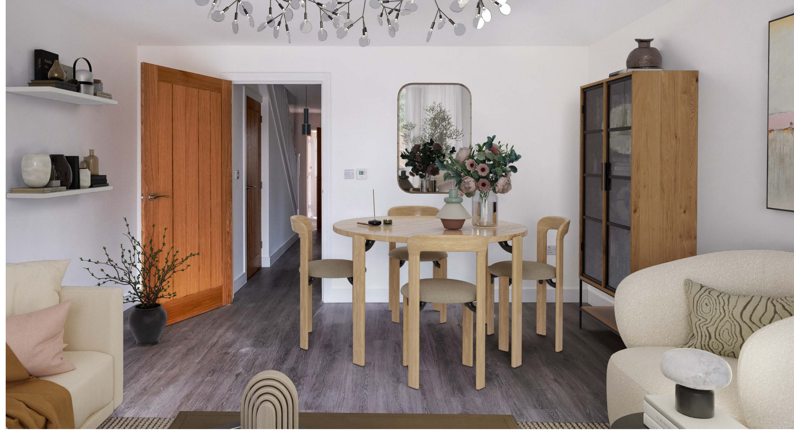
A dining area for more formal occasions.