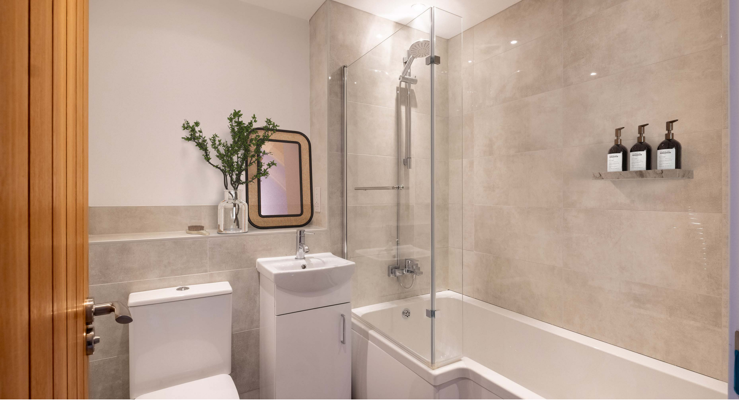
The family bathroom.