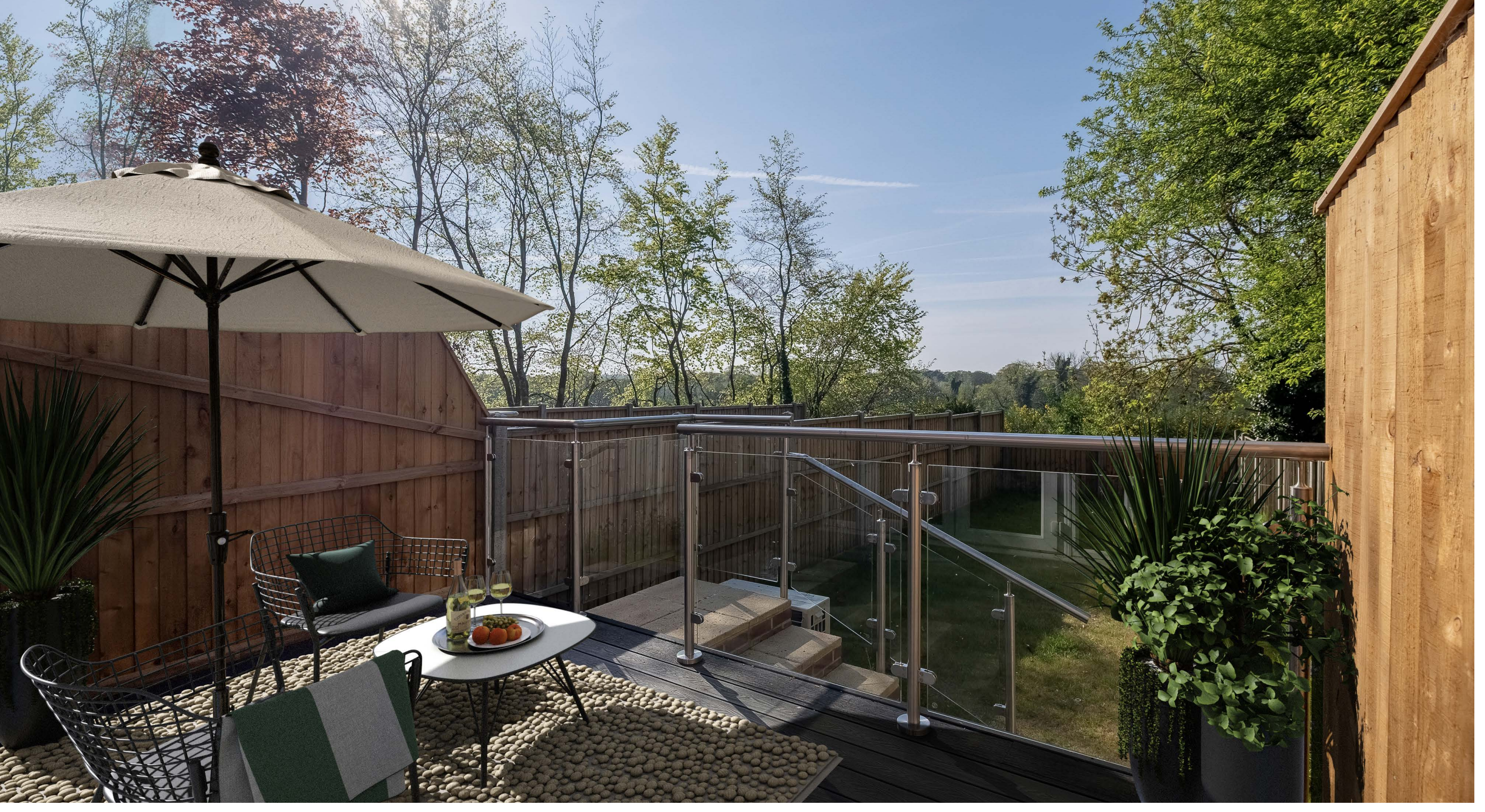
South facing terraces offer views of the surrounding countryside.