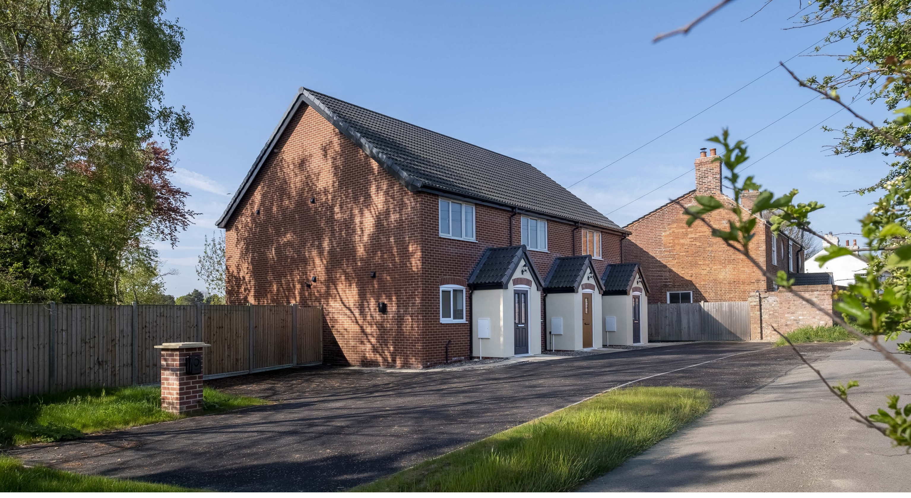
Church Lane offers a setting surrounded by countryside, yet with great access to local amenities.