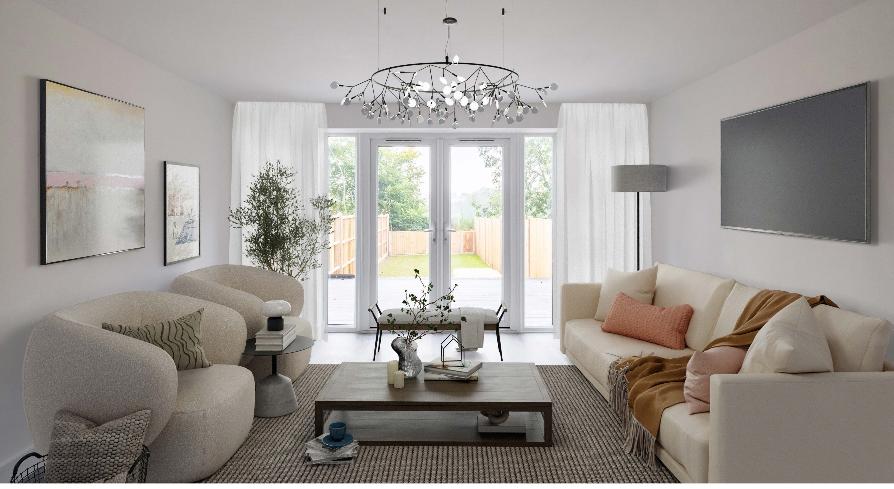
A living space which connects to the great outdoors.