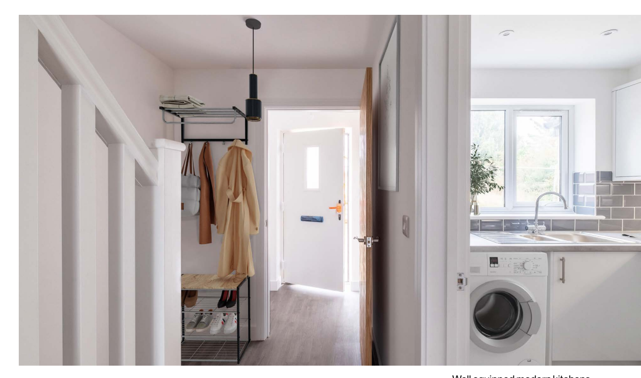
Well equipped modern kitchens.

• A generous entrance with porch inner hallway and kitchen access.