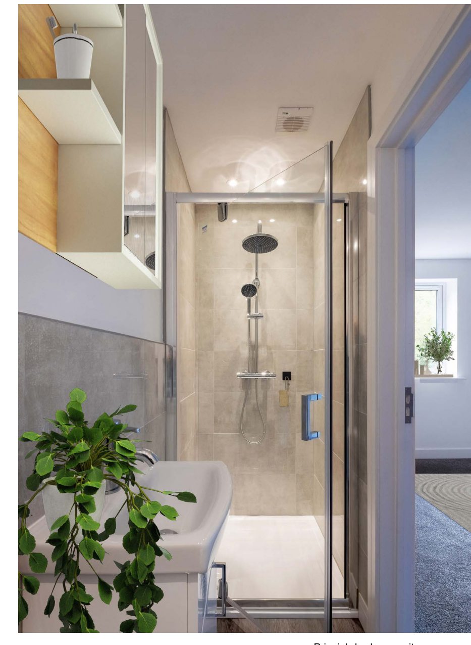
Principle bedroom suite.The ensuite shower room.