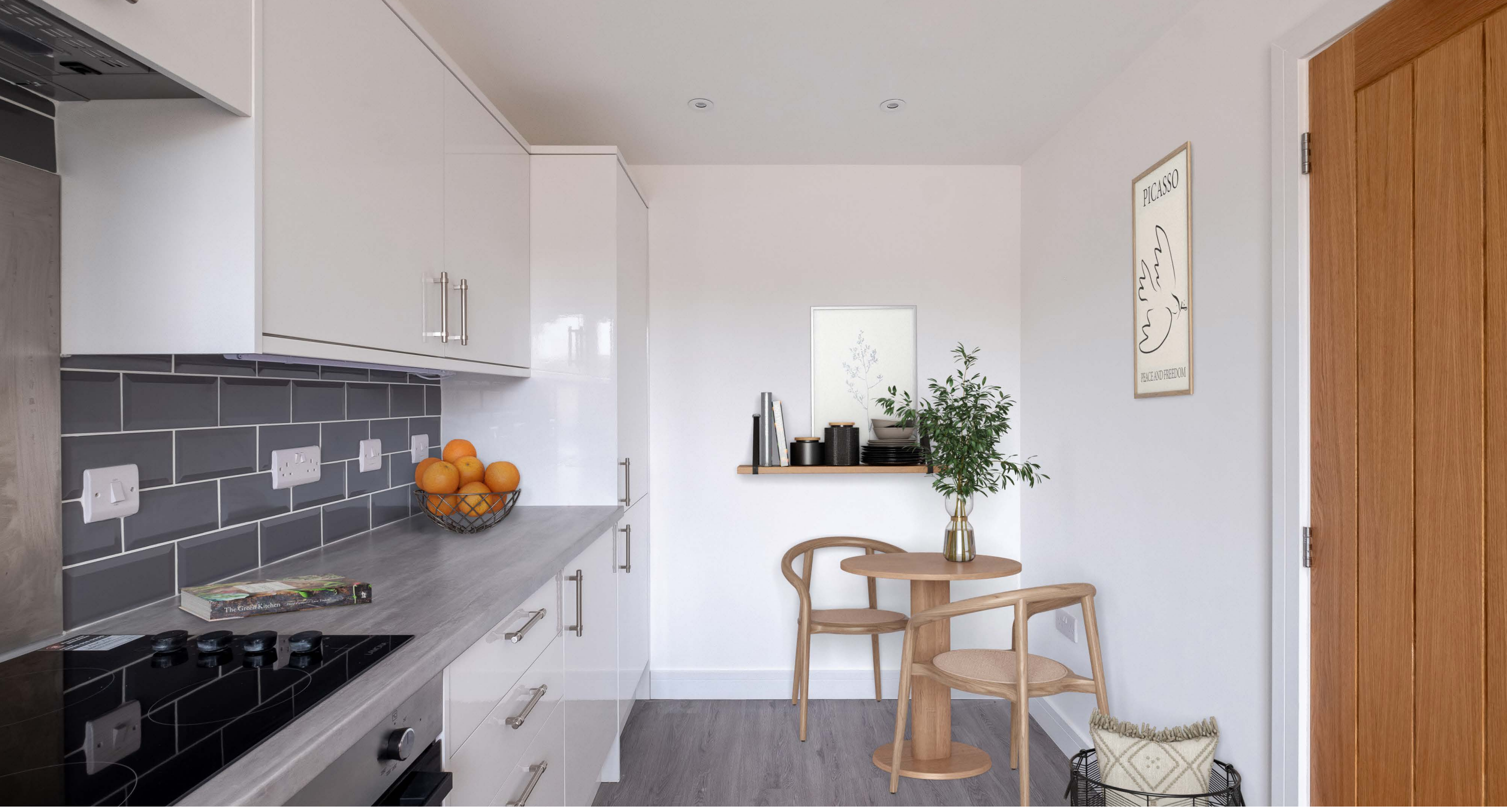
The kitchen offers ample storage, space to prep, and a spot for social dining.