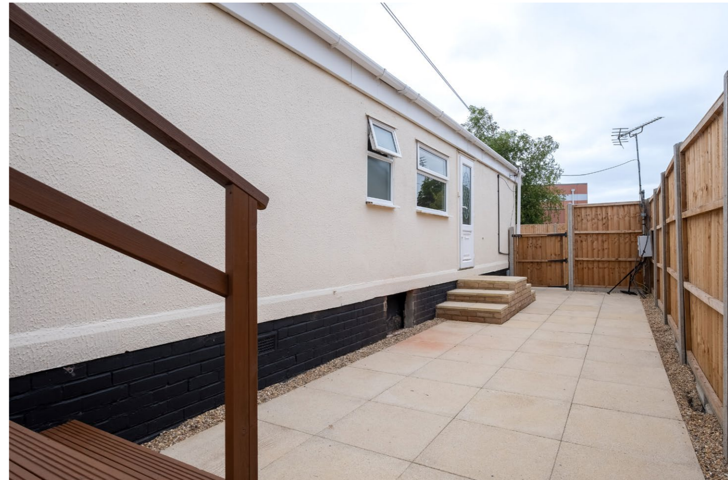
Southern side yard