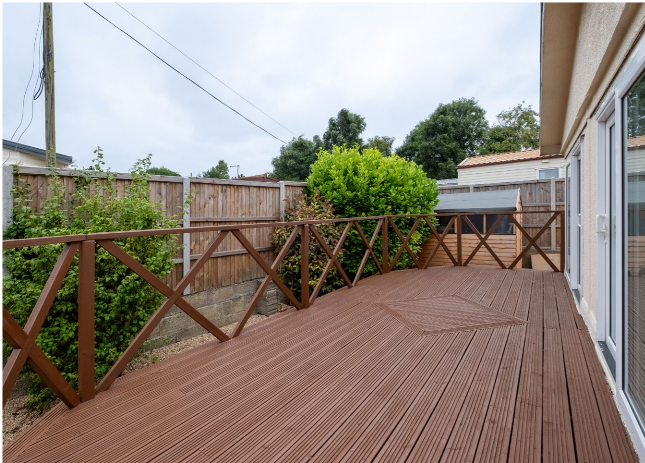
Garden raised decking