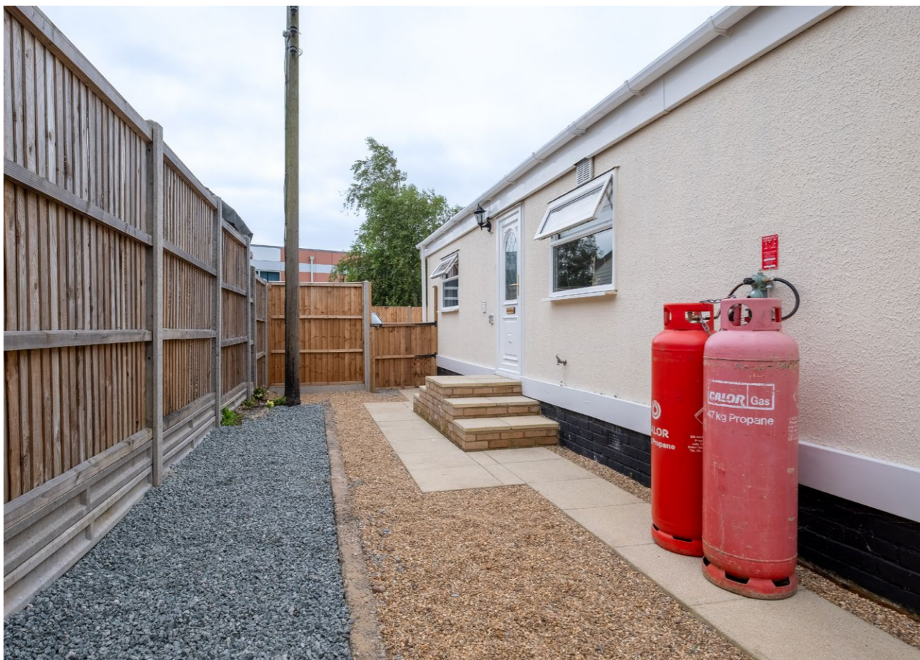
Northern side yard