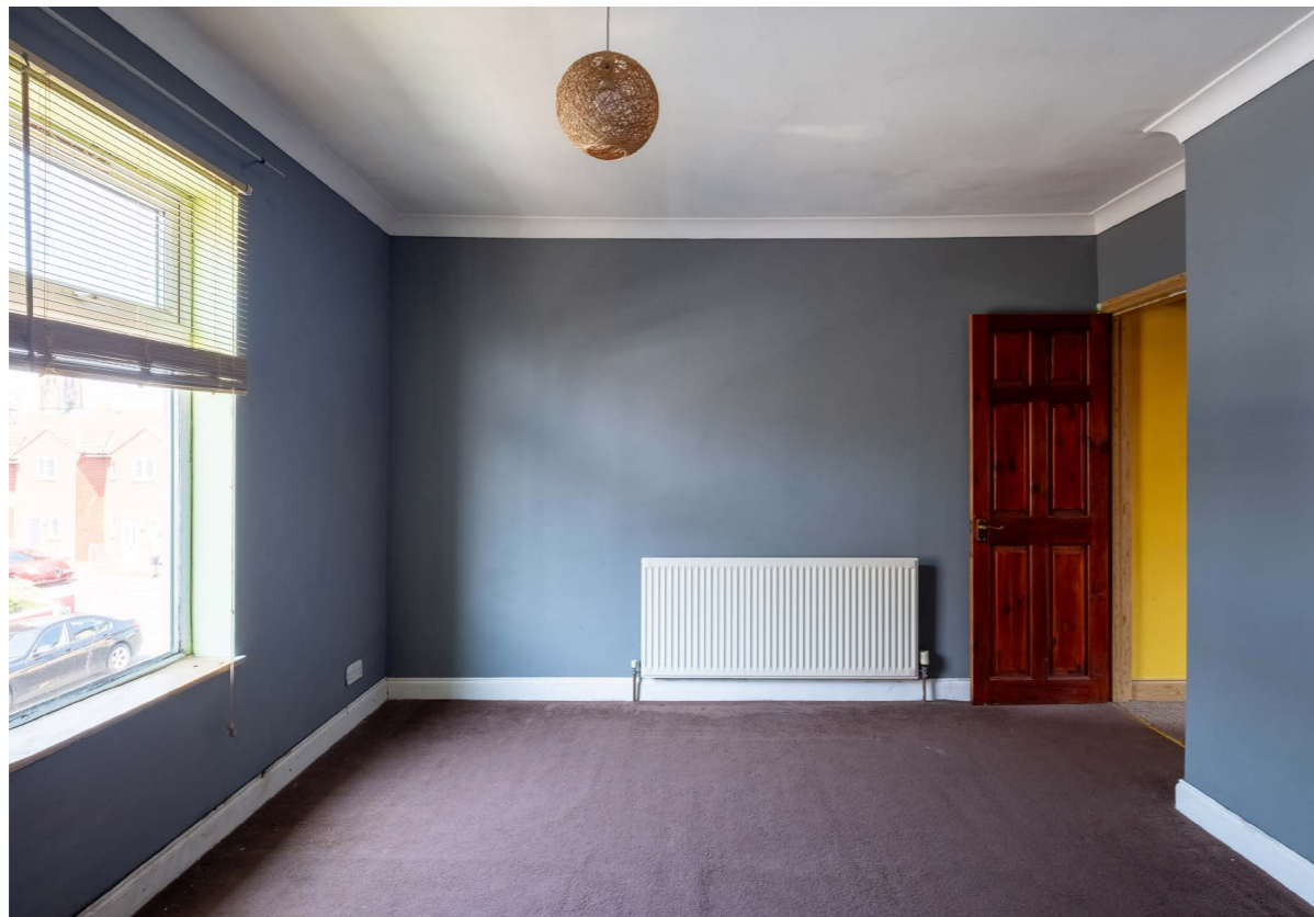
Alternate view of primary bedroom