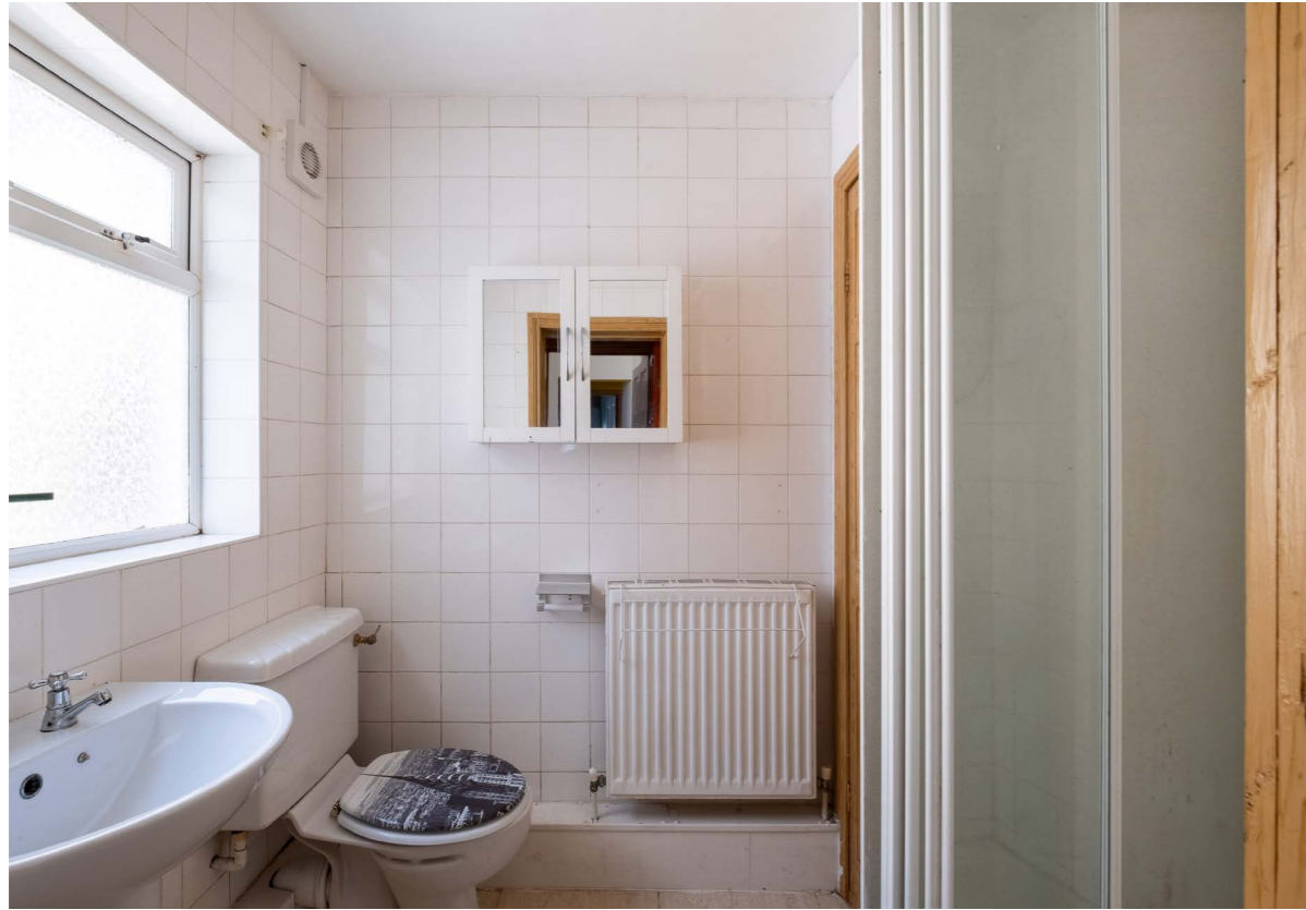
Ground floor shower room