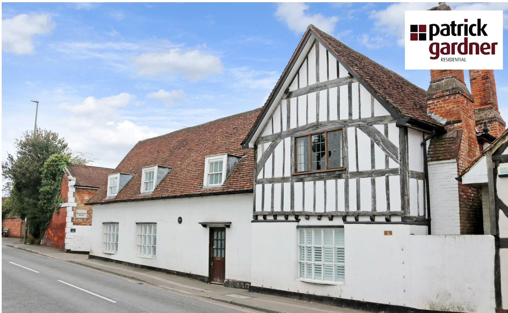
1 Devonshire House Church Street, Leatherhead, Surrey, KT22 8DP