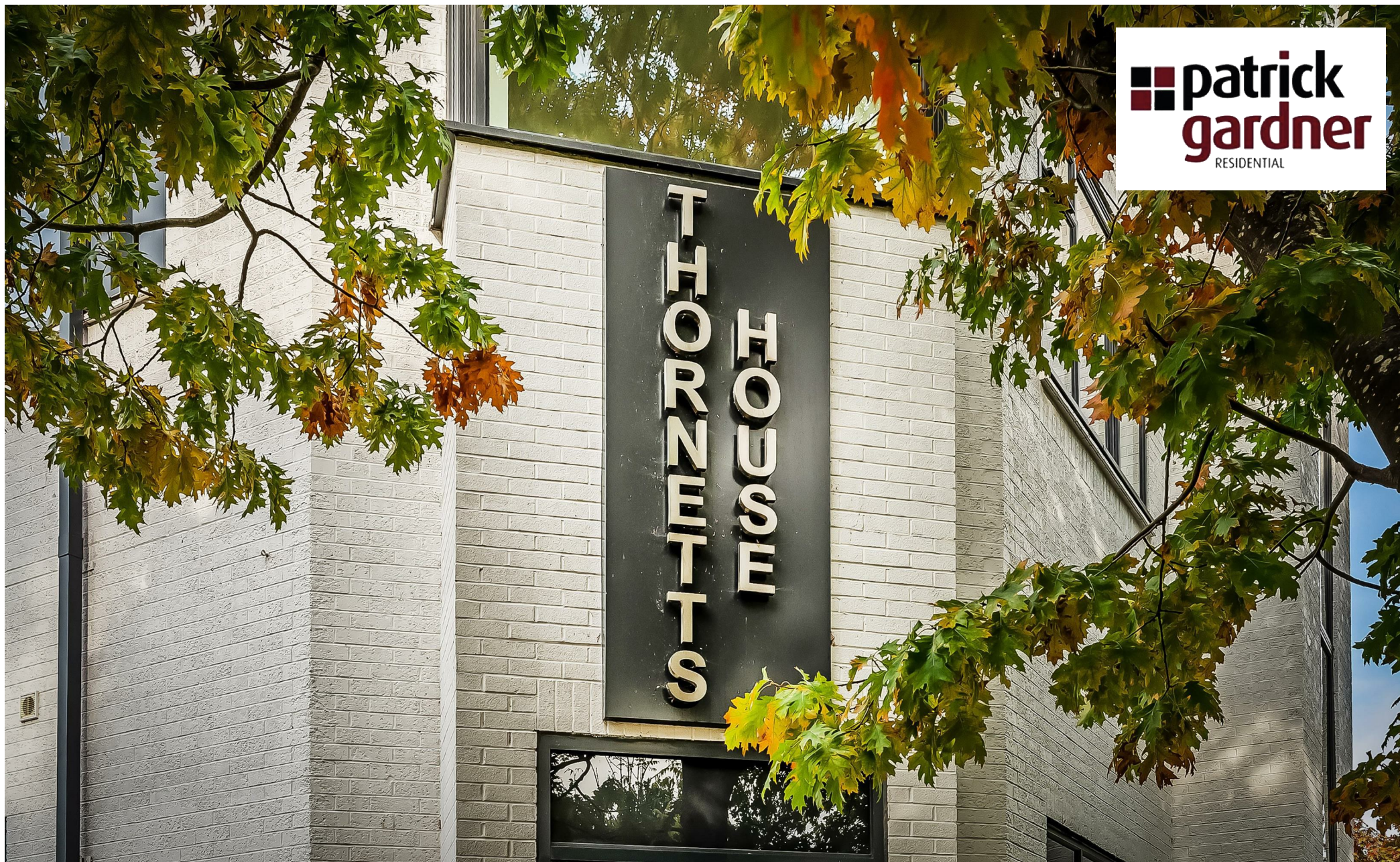
Thornetts House, 6 Challenge Court, Leatherhead, Surrey, KT22 7DE