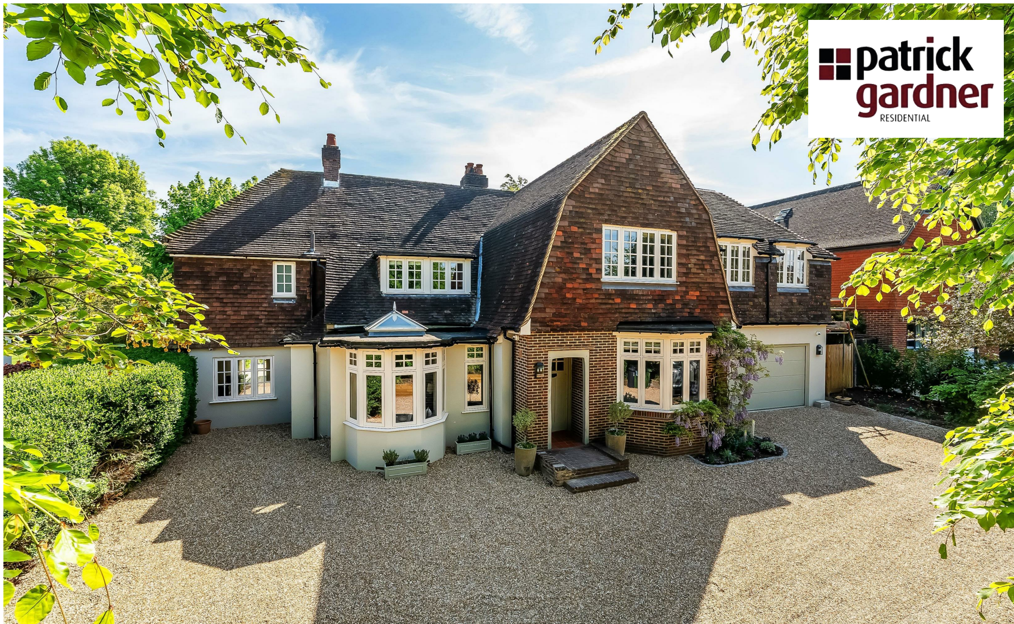
Hardwick Cottage St. Nicholas Hill, Leatherhead, Surrey, KT22 8NE