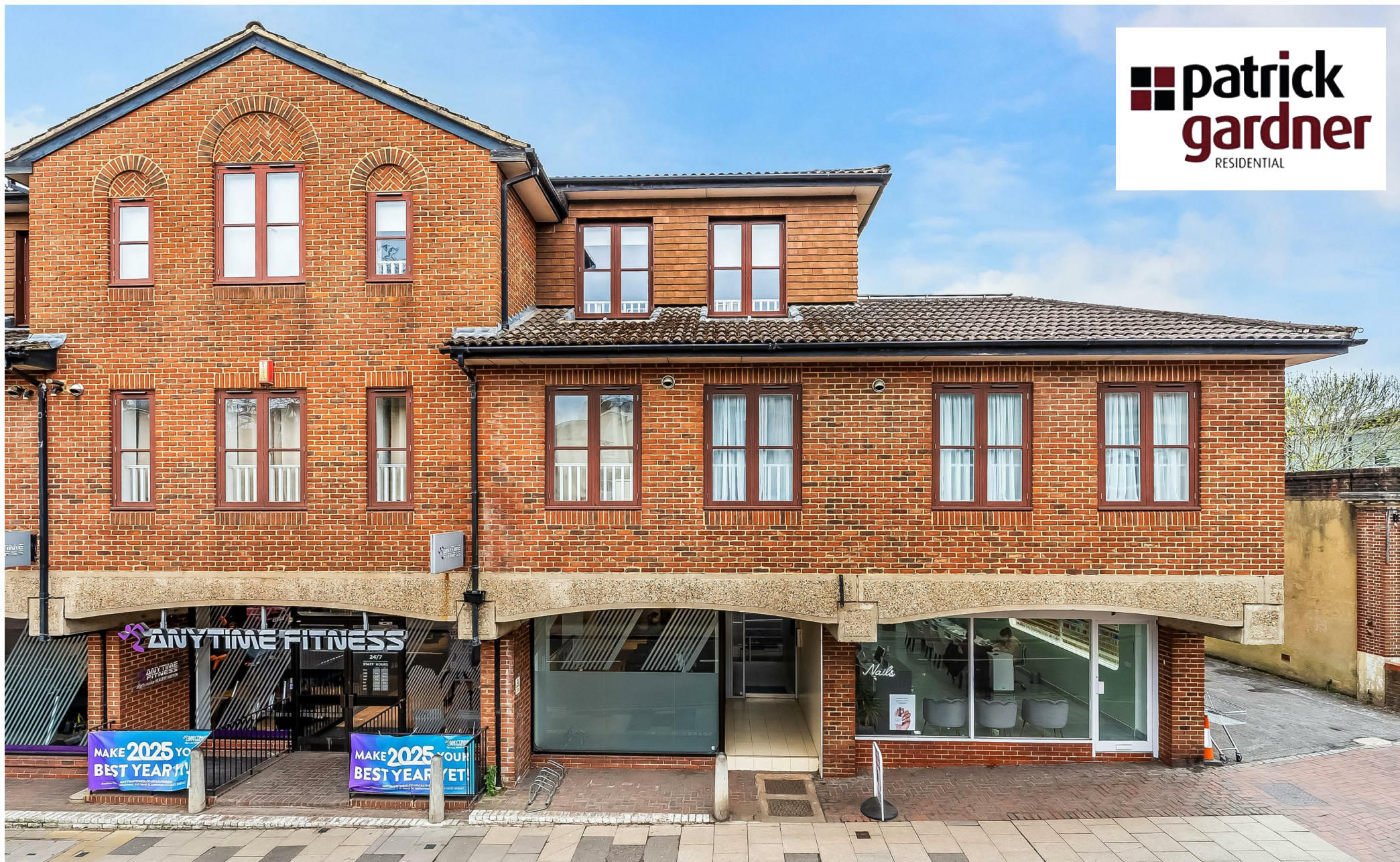
Flat 1, Grantham House 11-15 North Street, Leatherhead, KT22 7AX