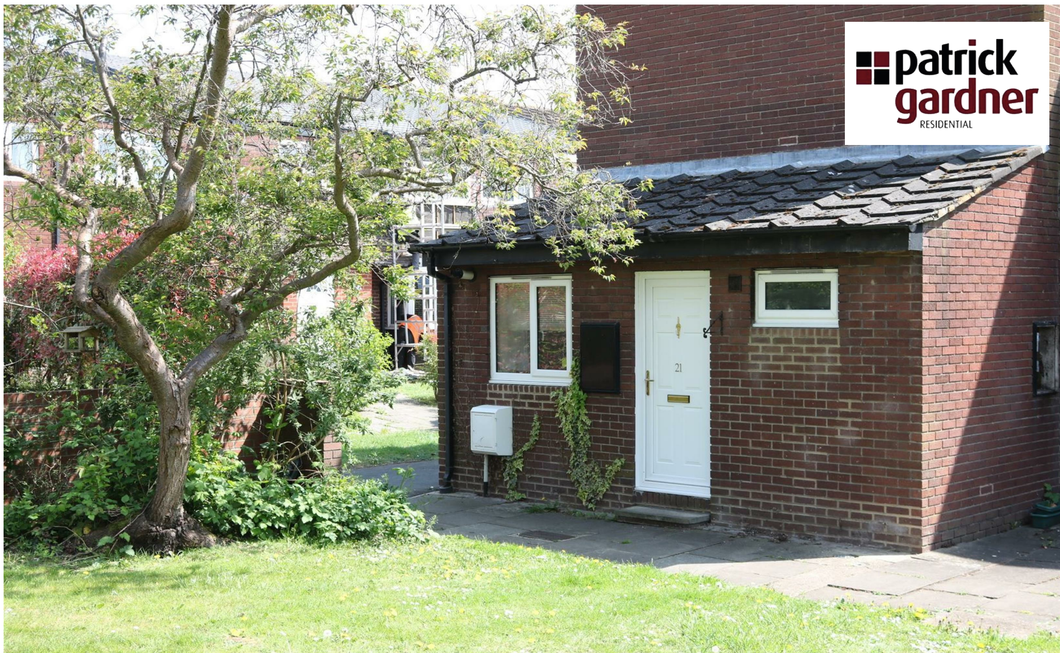
21 Waterfields, Leatherhead, KT22 7XB